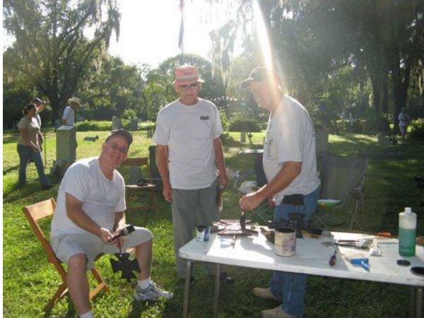
Cleaning and painting CSA Crosses

"Young" compatriots from Camp 1387. The Montague's plot curb was buried in ground cover as was the family member marker above. Three pickup loads of over growth and ground cover was removed, the curb uncovered, dirt filled in around markers and CSA Cross painted.