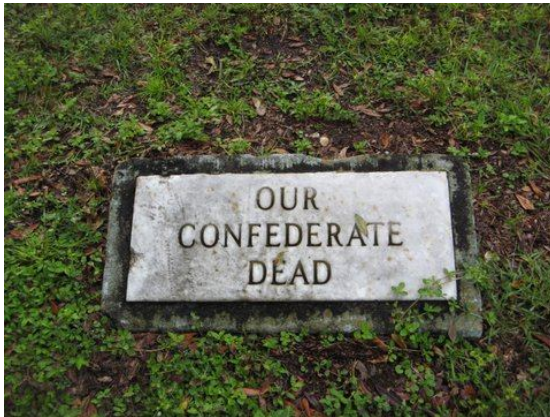
Marker was very uneven