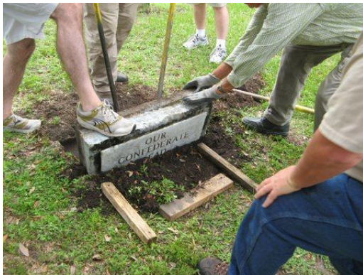
Even small stones are heavy