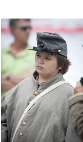
Youngest in Color Guard