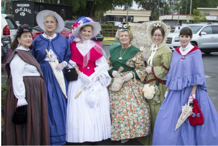
Some of the St. Augustine UDC Ladies

This year's Easter Parade in St. Augustine was a spectacular event! The SCV-UDC-OCR-COC had an outstanding presence with about 30 participants and 5 subunits that stretched almost a block long!