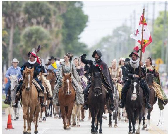
Must be ANV with those uniforms