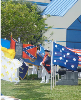
State plaque and ship cannon replica. Note our colors behind plaque.

Camp 1387 Color Guard participated in the 228th Anniversary Commemoration of the LAST NAVAL BATTLE OF THE AMERICAN REVOLUTION on 05 March. This SAR National Color Guard event, recognizes the March 10, 1783 naval battle fought offshore of Cape Canaveral, Florida. Capt. John Barry of the Continental Navy Ship Alliance was victorious over HMS Sybil, thereby saving the transport ship Duc de Lauzon and her cargo of much-needed funds headed for the Continental Congress.