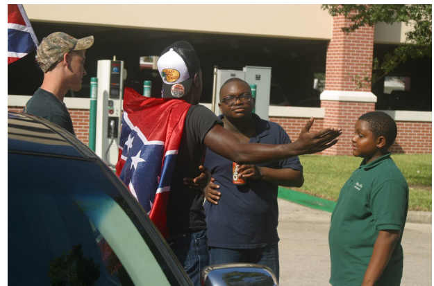
Young black folks from both sides

Friday 25 September Camp 1387 and Southern Pride Ride (Melbourne based CBF rallies) staged a self defense protest at Melbourne City Hall. The United Third Bridge, a Porto Rican group trying to gain public recognition by riding NAACP coat tails, held a protest against the Confederate Battle Flag http://utbunitedthirdbridge.com/about.php .